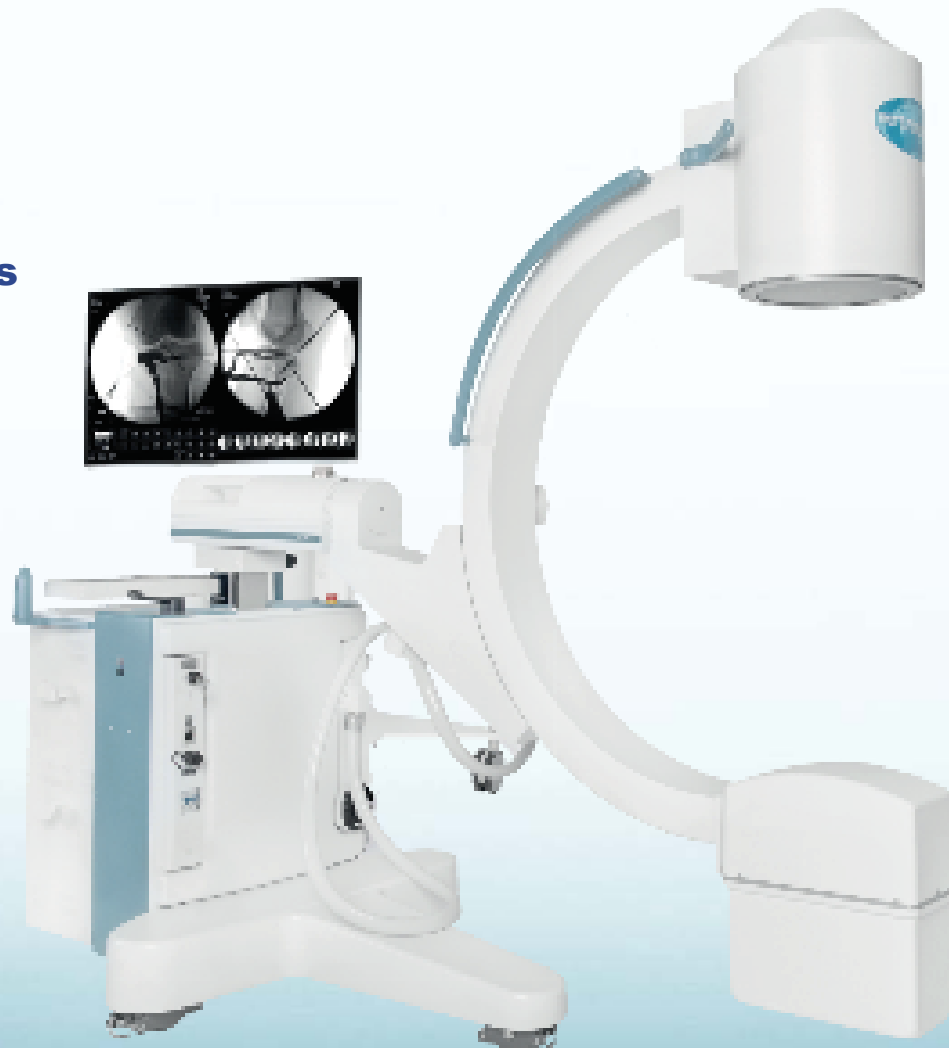
RADIUS SINGLE MODEL

Radius is a highly reliable, tough and enduring mobile system for surgical fluoroscopy. Designed for granting the best performances with the maximum affordability.