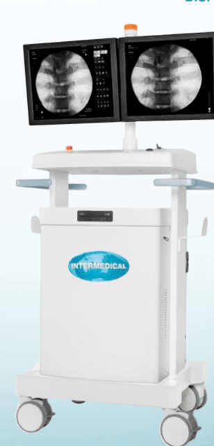
AFG & DFG Monitor Trolley Version