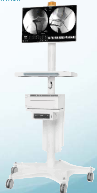
DIM HD Monitor Trolley Version

Available in different models, with 9" or 12" image intensifier and different software memories.